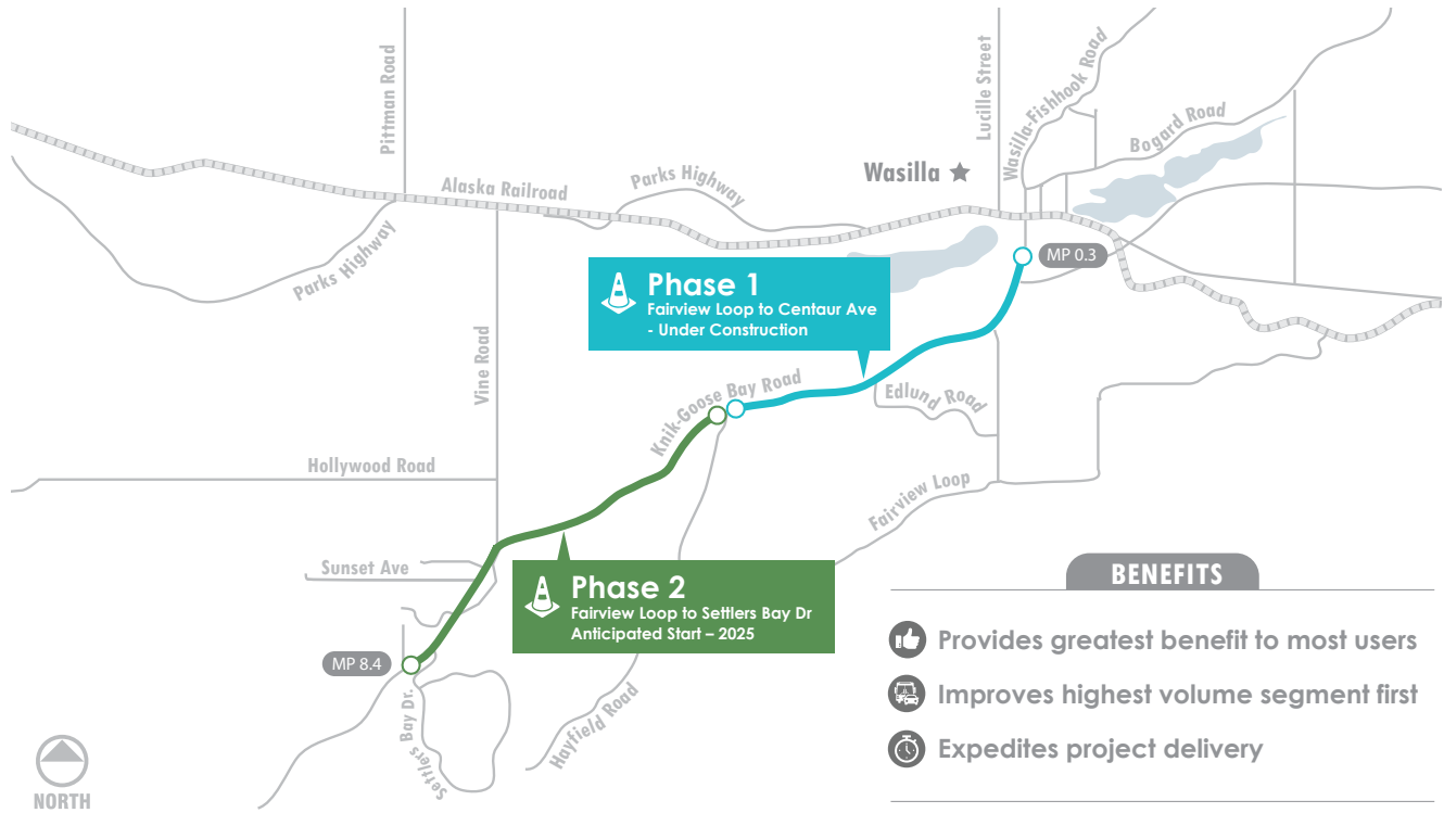
Figure 2: Construction Phasing Plan