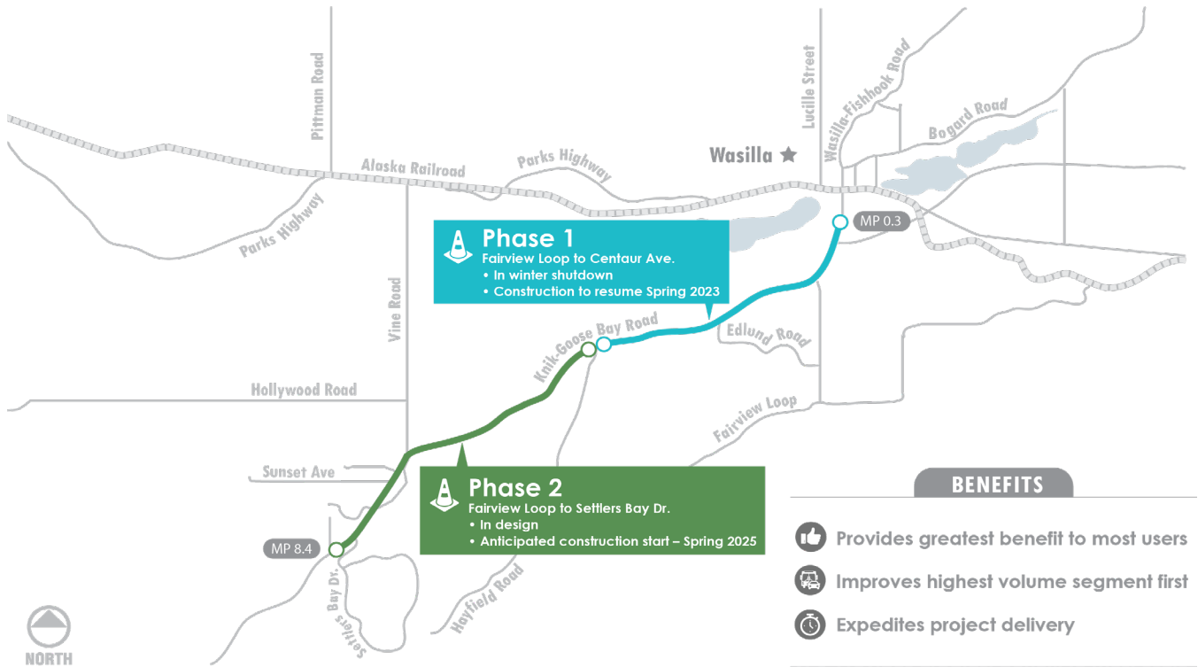
Figure 2: Construction Phasing Plan